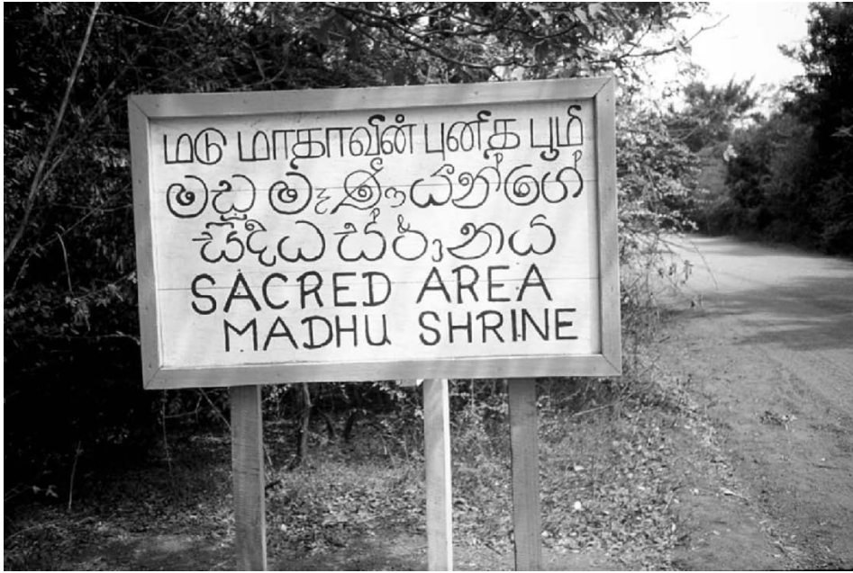
Figure 3. Sign marking Madhu Open Relief Centre (ORC).

fatigues were to be worn. Unlike Bosnia or Somalia, the Open Relief Centre at Madhu was politically neutral, completely demilitarised, and without international troops to enforce peace. It was further distinguished from welfare centres in Sri Lanka that hosted displaced people by its long history and well-known reputation as a safe place before the war began and UNHCR arrived (Hyndman, 2003).