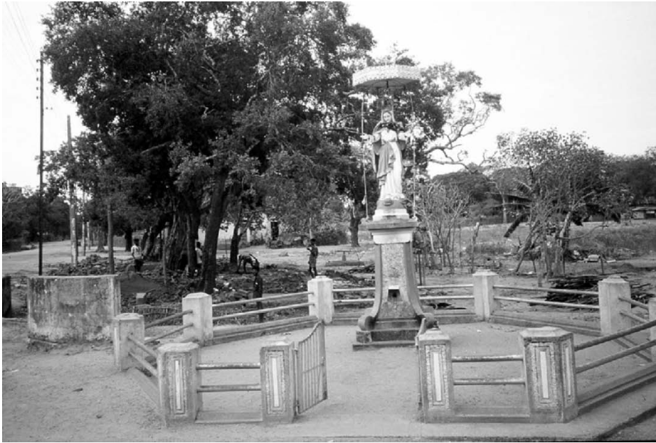
Figure 4. Statue of the Virgin Mary outside Madhu Shrine.

displaced people. These changes illustrate the radical shifts generating displacement in the North, especially in areas close to the 'frontlines' (Fig. 4).