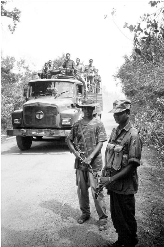
Figure 5. Army troops on the Vavuniya-Madhu Road.

Similarly, a given road may change hands from month to month; the Vavuniya–Madhu road was controlled by the LTTE throughout most of our study period, but for a brief window of time the Sri Lankan Army patrolled this access route.