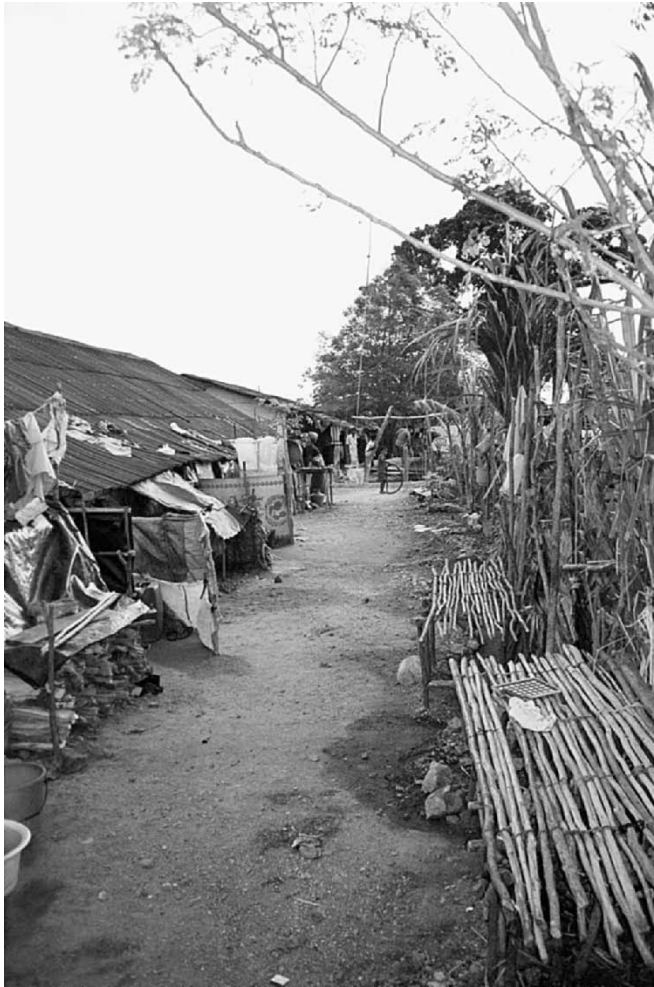
Figure 2. Government-run welfare centre, Vavuniya.

viewed tacitly by the government as a potential security threat, so their concentration in the centres may have other geopolitical meanings. In June 2000, some 25 000 displaced people occupied 17 Welfare Centres in Vavuniya District. For these occupants, the centres were anything but safe when the LTTE released a public injunction that all civilians should leave the area for their own safety; the implication was the LTTE was planning an attack of the area. The displaced people who resided in these Centres were prohibited from leaving by government authorities, and waited in fear to see if the LTTE would indeed take Vavuniya city and/or harm them. Fortunately, they did not. Even in contexts where an attack by the LTTE might be less imminent, the Welfare Centres remain sites of great anxiety and tension as they are easily accessible to other Tamil militant groups, now working in tandem with the Sri Lankan government, who use them as recruiting grounds (Fig. 2).